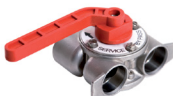
Stainless steel by-pass