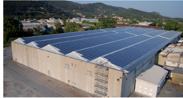
Fleck production site in Pisa, Italy

Fleck Controls, Inc. was founded in the U.S. in 1950. It started to produce brine valves in 1958 and the first water softener valve in 1963. In 1995 Fleck was acquired by Pentair, the world leader in high technology flow control products providing innovative solutions for residential, commercial and industrial applications.