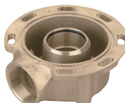
Rotating side mount adapter for 2850 or 2910